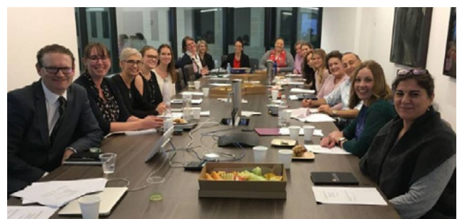
NSW Clinic co-ordinators at the 2nd Air Academy meeting

Read more about the Academy: https://www.projectairstrategy.org/academy/index.html ●