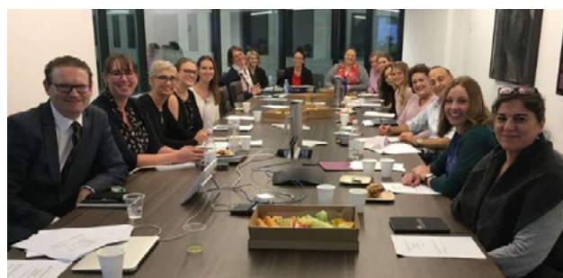
NSW Clinic co-ordinators at the 2nd Air Academy meeting

Read more about the Academy: https://www.projectairstrategy.org/academy/index.html ●